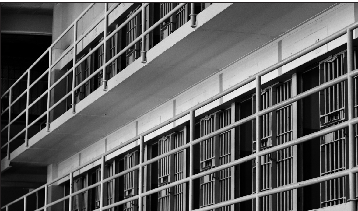
Elkton Federal Prison, interior.

Of course, a prison sentence is supposed to hurt. Punishment is, after all, defined as the deliberate infliction of pain or loss for an offense, sin, or fault.