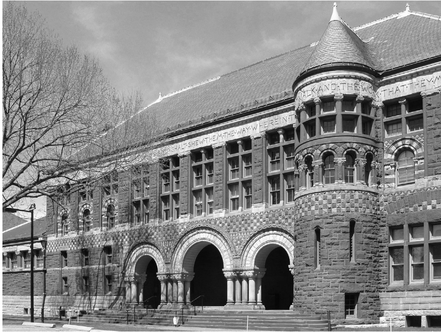
Austin Hall, a classroom building of the Harvard Law School.

with only one other female classmate. This put a kind of pressure on the women because if a woman was called on, she worried that a wrong answer would reflect badly not only on her but on all women. So the women were always on their toes, always well prepared. Later, a law professor at Columbia remarked that he longed for the good old days when there were only a few women in his law classes because if things were going slowly and he wanted a crisp answer, he could always call on a woman. “Nowadays,” he remarked, “there’s no difference; the women are as unprepared as the men.” 34 Other sections in the Harvard Law School held “Ladies Day,” when only women were called on, while they were ignored the rest of the year, but Ruth and the other woman in her section were spared that ordeal.