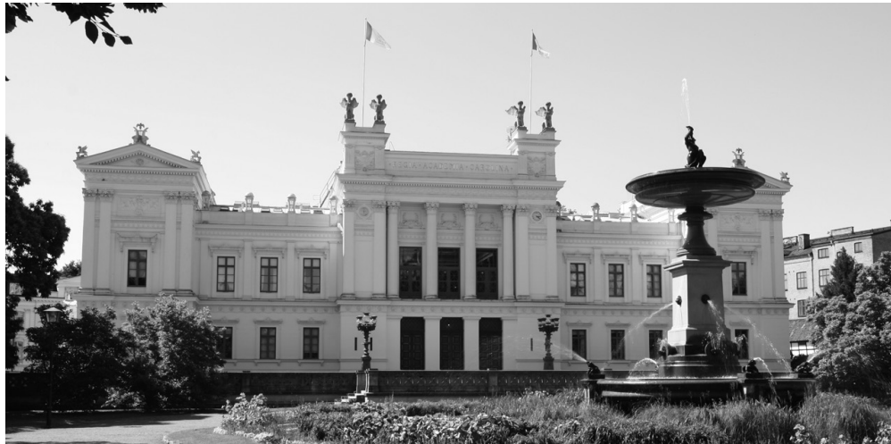
University of Lund, Main Building.

Inflation in Sweden meant that most families required two incomes. A Swedish writer, Eva Moberg, published a column in a Swedish daily paper, asking, “Why should women have two jobs and men only one?” 57 The idea was that the woman might have a job to help with living expenses, but she was still the one expected to shop for children’s shoes and have dinner on the table at seven o’clock. How fair was that? Moberg’s argument—that women would not achieve equality simply from entering the workforce, and men would have to enter what was traditionally considered the woman’s sphere before there would be equality—was one that Marty and Ruth had already worked out for themselves. The whole debate was still a few years away from reaching the United States. Ruth was fascinated by the responses from different women. Some women were queen bees—they could handle everything, thank you very much. Others felt it was time for men to do their share of the housework, a revolutionary idea in 1962.