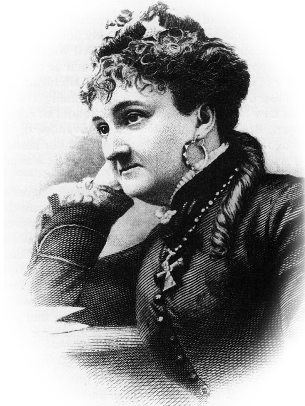
Myra Bradwell, February 12, 1831

They were married in Chicago on May 18, 1852.