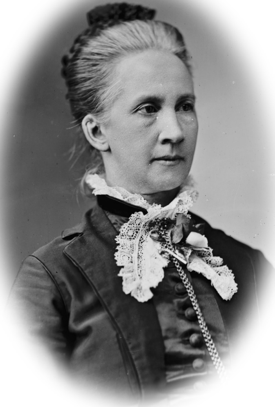
Belva Ann Bennett Lockwood, circa 1870.

fifteen women entering the first-year class of National University School of Law, which is also now part of George Washington University. She finished her coursework, but none of the women were allowed to go through graduation or receive diplomas. She wrote to President Grant and eventually received her diploma, but she was the only woman in her class to do so. In 1906, she became the first woman to argue before the Supreme Court. She represented the Cherokee Nation in a lawsuit alleging that the U.S. government violated a treaty. She won, securing a judgment of $5 million for the Cherokee Nation.