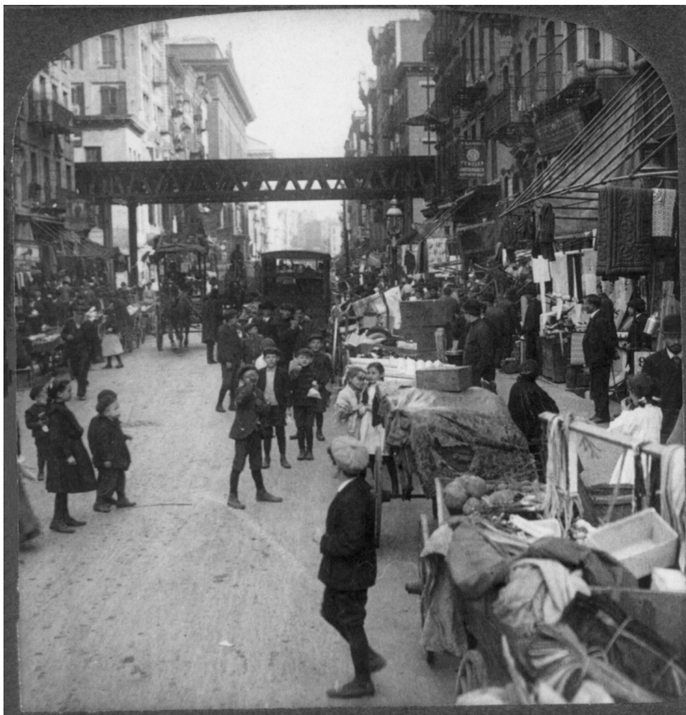
The original caption read: "How the 'other half' lives in a crowded Hebrew district, Lower East Side, NY. 1907.