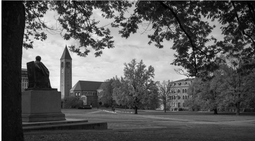
Cornell University Arts Quad.