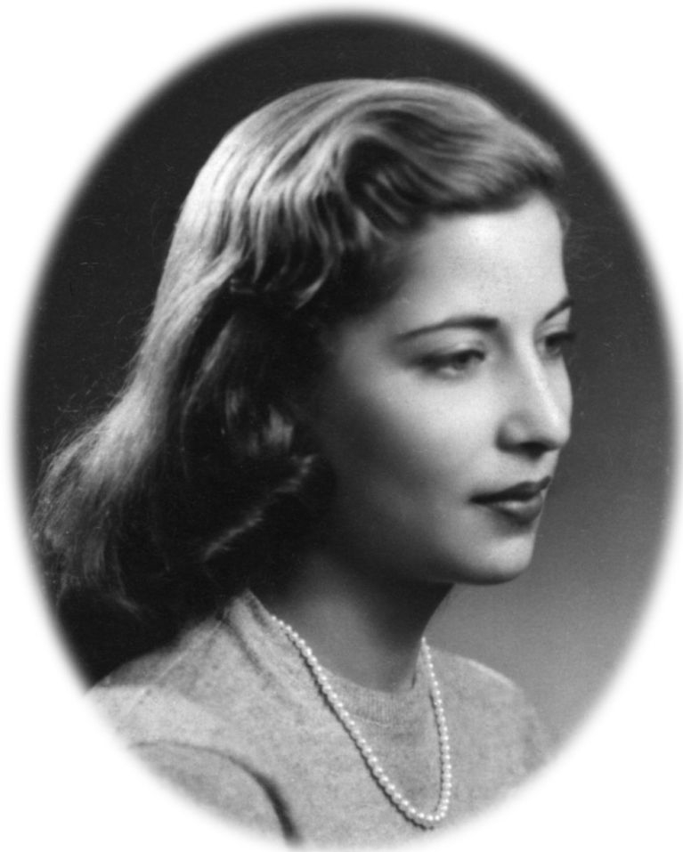
Ruth Bader Ginsburg as a college senior in 1954.