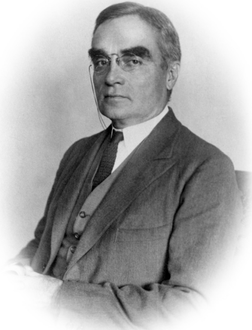
Learned Hand, circa 1910.

for flexibility, and the truth of one of Learned Hand's famous sayings—"spirit of liberty is the spirit which is not too sure that it is right." 53 At one point, she felt absolutely sure she knew the answer to a question: Does a federal district court have authority to transfer a case, although the transferee court lacked both subject matter and personal jurisdiction? She and Judge Palmieri discussed the question, and came to the same conclusion: The court was powerless to do anything but dismiss the case. The second circuit affirmed the dismissal on appeal. The case went to the Supreme Court. The Supreme Court reversed, saying that Ruth and her judge got it wrong. The Supreme Court explained that we have only one federal court system, so dismissal would not be appropriate because the litigants would have no other venue for their grievances. Many times over the coming years Ruth reflected on the Supreme Court's analysis, and she came to understand her error.